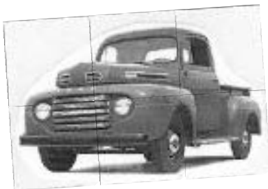
1941 F-1 Pickup

A part of the Centennial was a group of 43 Model T's that left Lancaster, California on May 25 th and reached Dearborn on June 12 th . Top speeds ranged from 14 m.p.h. while climbing the Rocky Mountains to 35 m.p.h. on the flat roads. We met a couple from Salinas who made the trip and asked how they were going home, the lady said the car was going back on a truck but she was ready to do it again, but just not