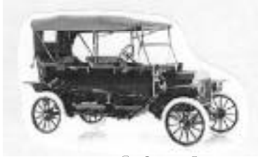
1914 Model T

Even though this is a news letter for Pontiacs of Central California and not Fabulous Fords Forever, we do share a common interest, our love for our cars and what the industry has contributed to society and the economy. But the Ford Motor Company is 100 years old.