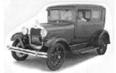
1928 Model A