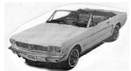
1964 1/2 Mustang