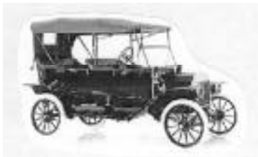
1914 Model T