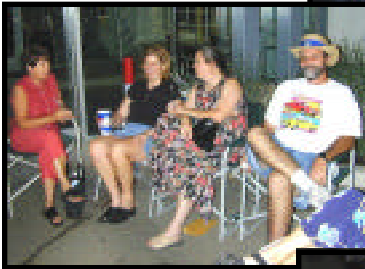
Here we are, enjoying the evening