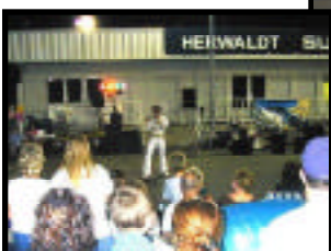
Elvis is alive and well in Fresno.