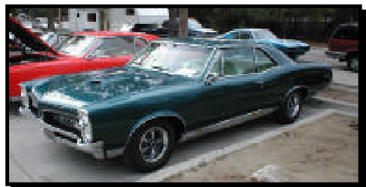
Completed and at the Western Regionals